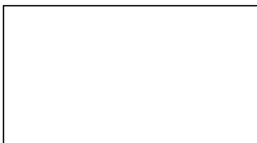
Figure 1. Example of figure. (9P't, Italic)

Please insert your Methods text here. Text alignment is formatted as justified. Figures, like Figure 1, should have a self-explanatory caption placed under the figure and should be referenced in the main text like in this sentence.